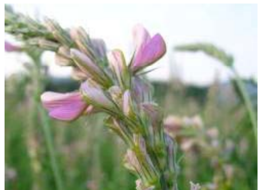
Fooder crops like Chicory and Sainfoin (Esparsette)