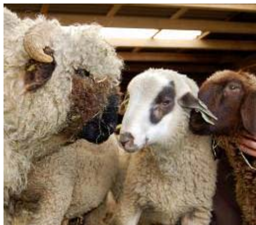
Variation in genetic tolerance?