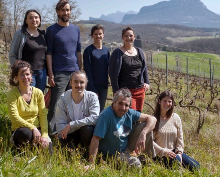
Team photo (from top left to bottom right)